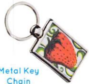
Metal Key Chain