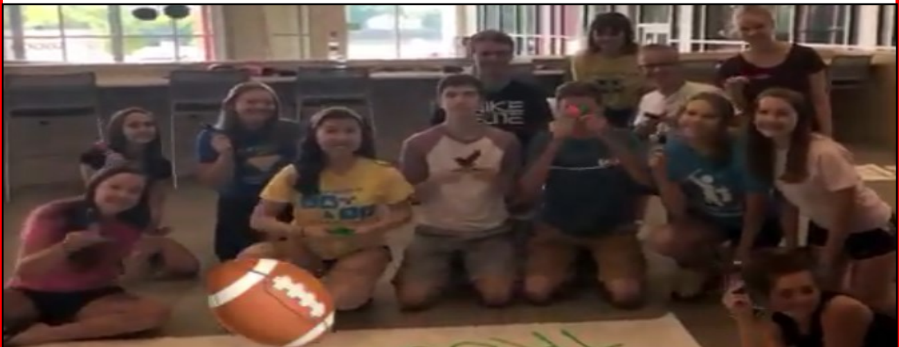
Student Council members getting posters ready for Homecoming Week

We ask everyone to do your part to make for a safe and enthusiastic Homecoming Week!