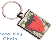
Metal Key Chain