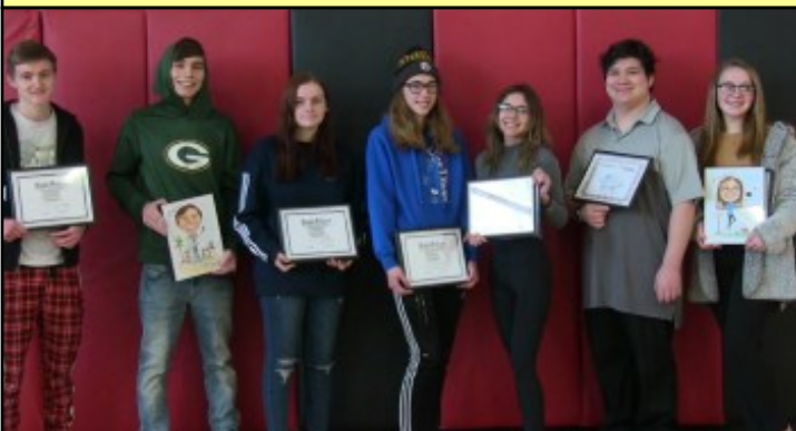
Pictured above are mid-year COMPASS grads. Congratulations students!

Any seniors planning to graduate at the end of 3rd Quarter are required by Board Policy to have a signed Early Graduation form to the Principal's Office by March 2, 2020. Students wishing to graduate at the end of 3rd Quarter must have a signed Early Graduation form to the Principal's Office by March 2, 2020. Students should see their counselor for information regarding Early Graduation and the form required prior to School Board approval.